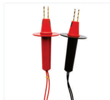
Test leads - Bond Testing