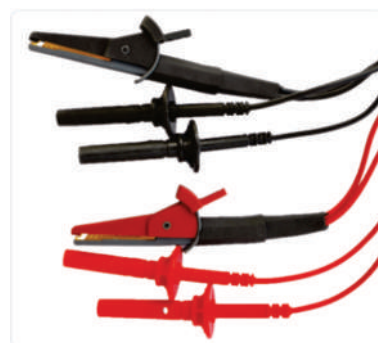
Test leads - Kelvin clip.